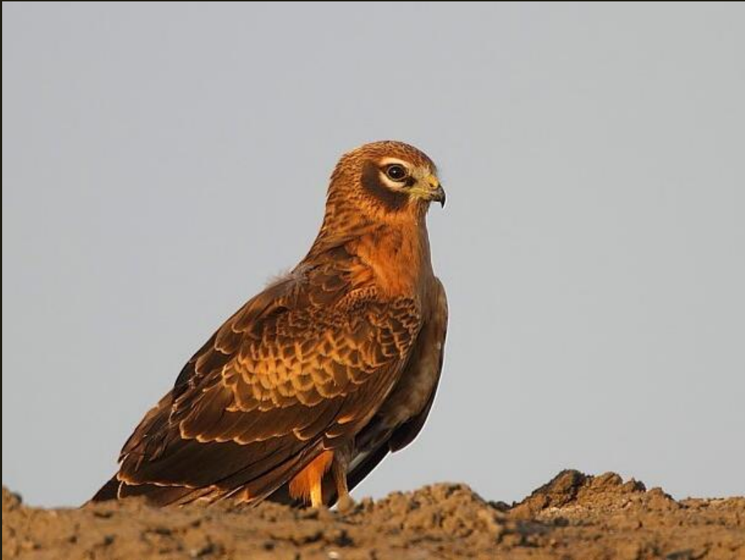
Montagu's Harrier (Juv)