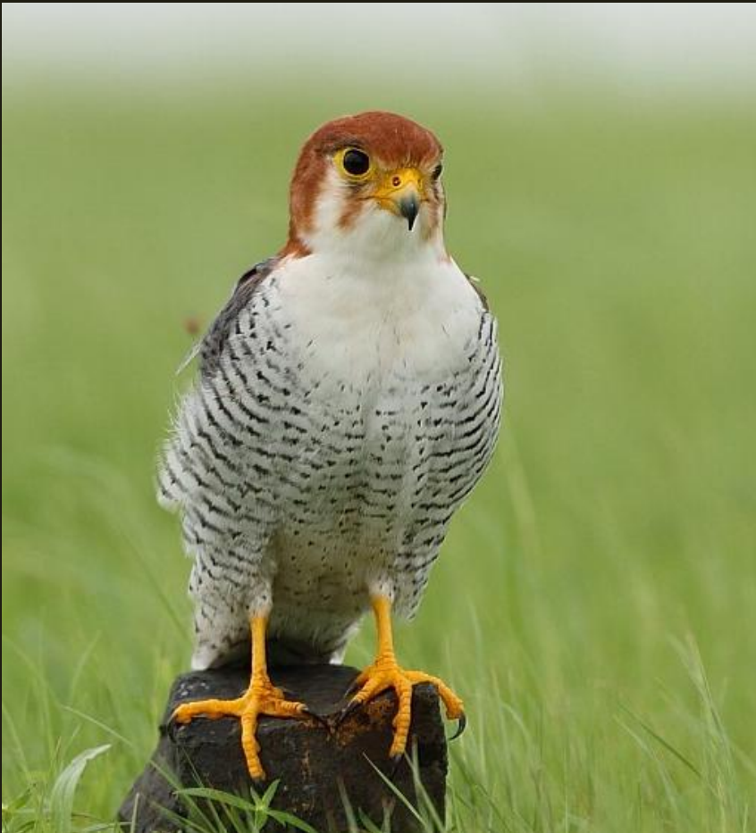
Red Necked Falcon (Adult)