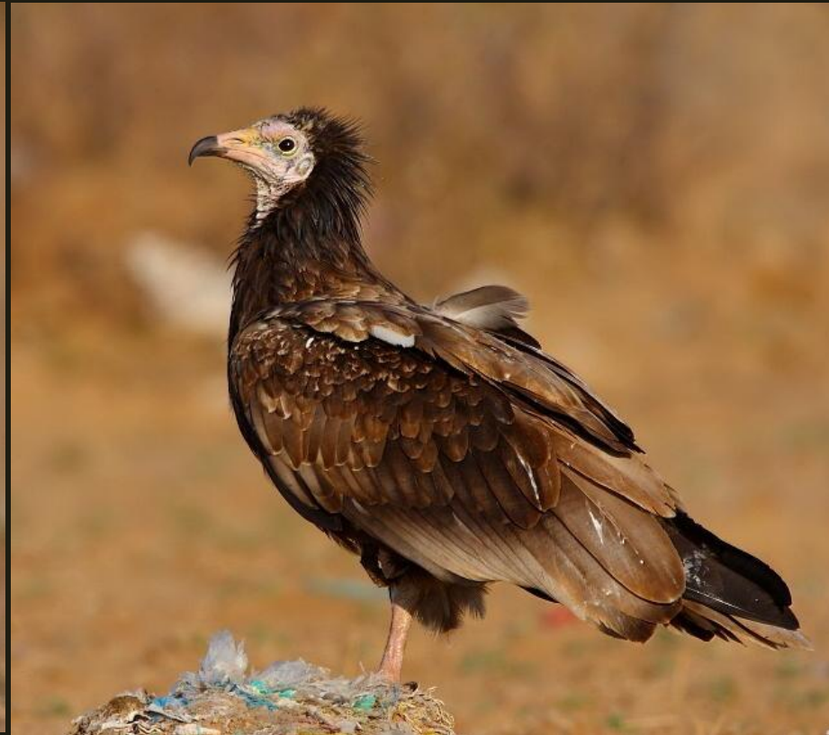
Northern Race (Migratory)