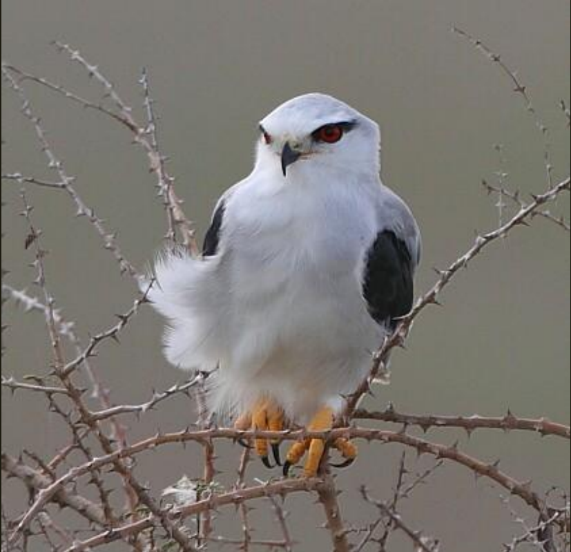
Black Winged Kite