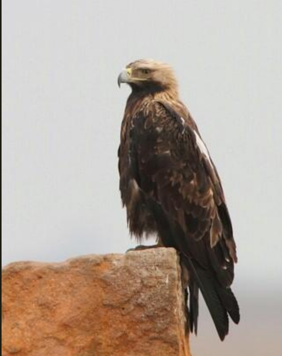
Eastern Imperial Eagle (Adult)