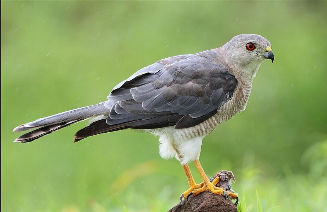
Shikra (Adult Male)