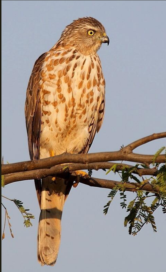
Shikra (Juvenile 1)