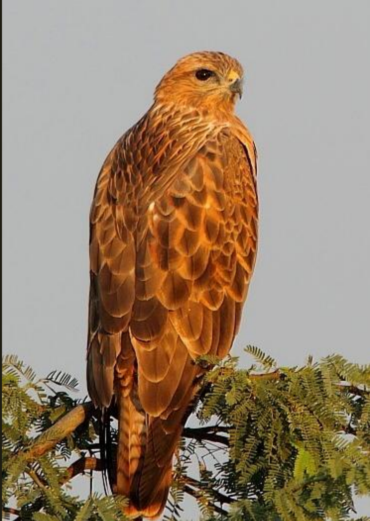
Common Buzzard 1