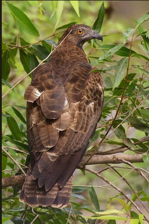
Oriental Honey Buzzard (Adult Female)