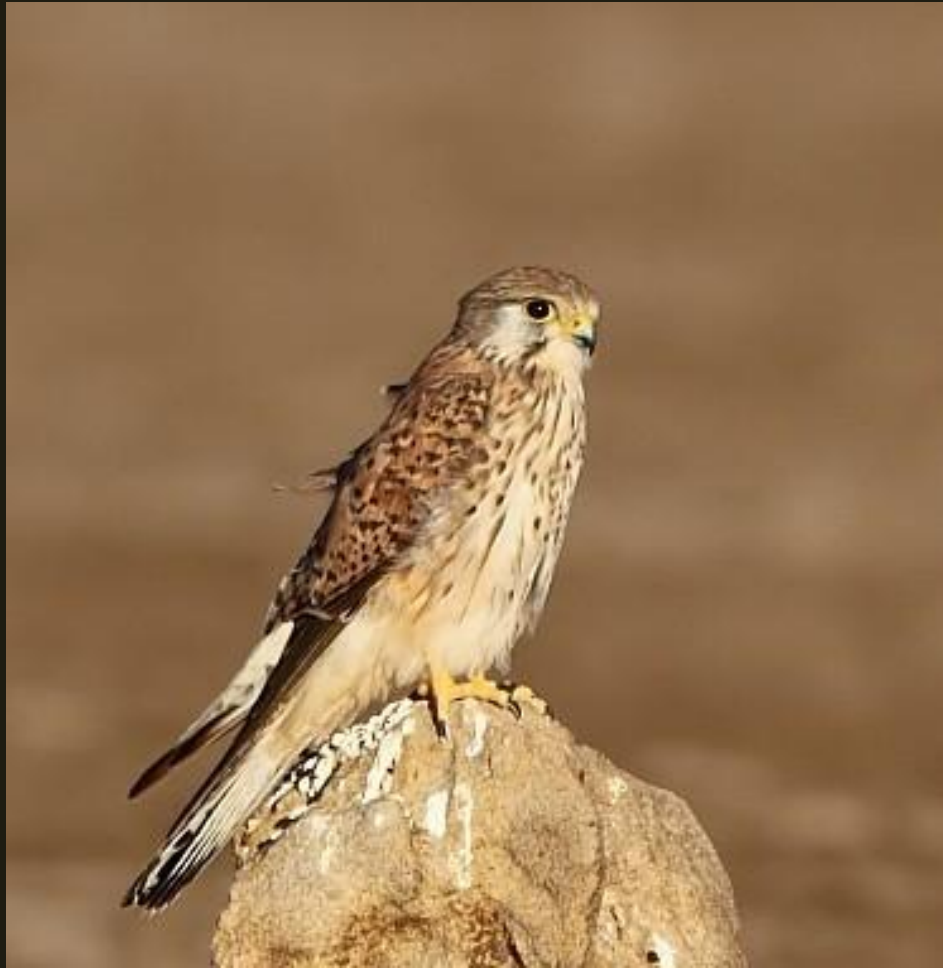
Common Kestrel (Female)