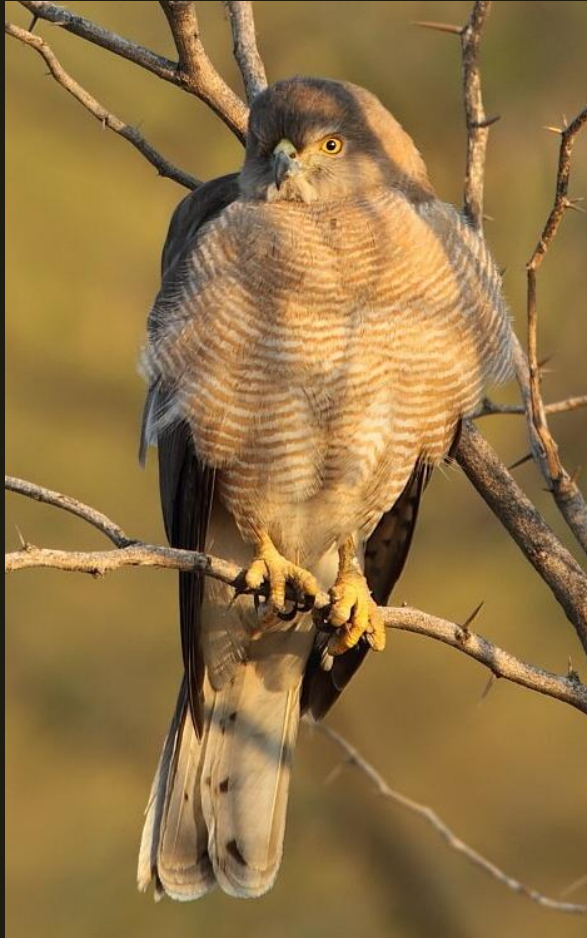
Shikra (Adult Female)