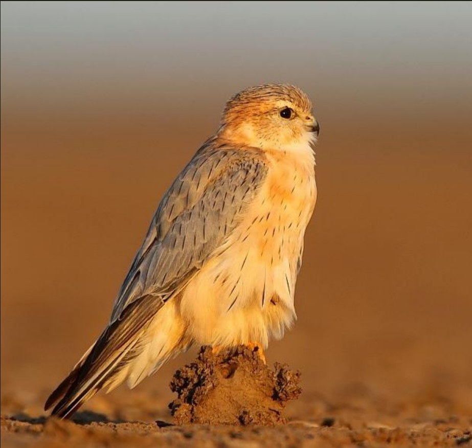
Merlin Male 2