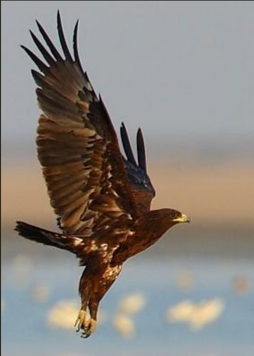
Greater Spotted Eagle