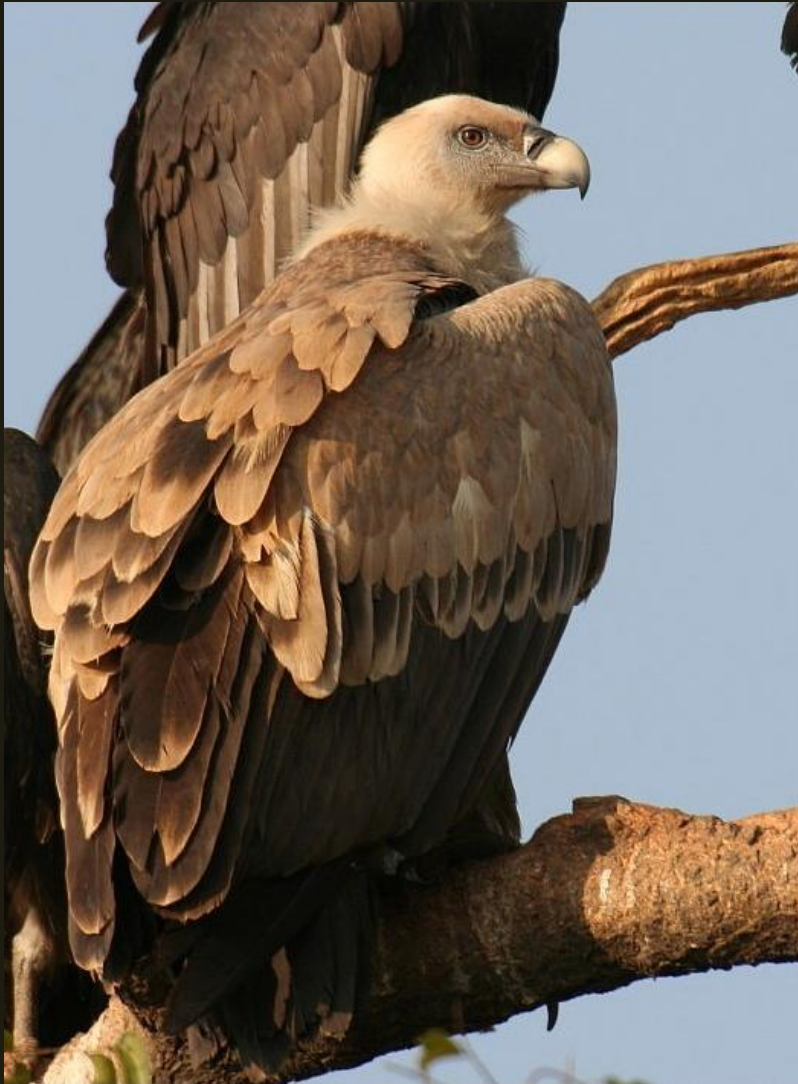
Eurasian Griffon Vulture (Adult)