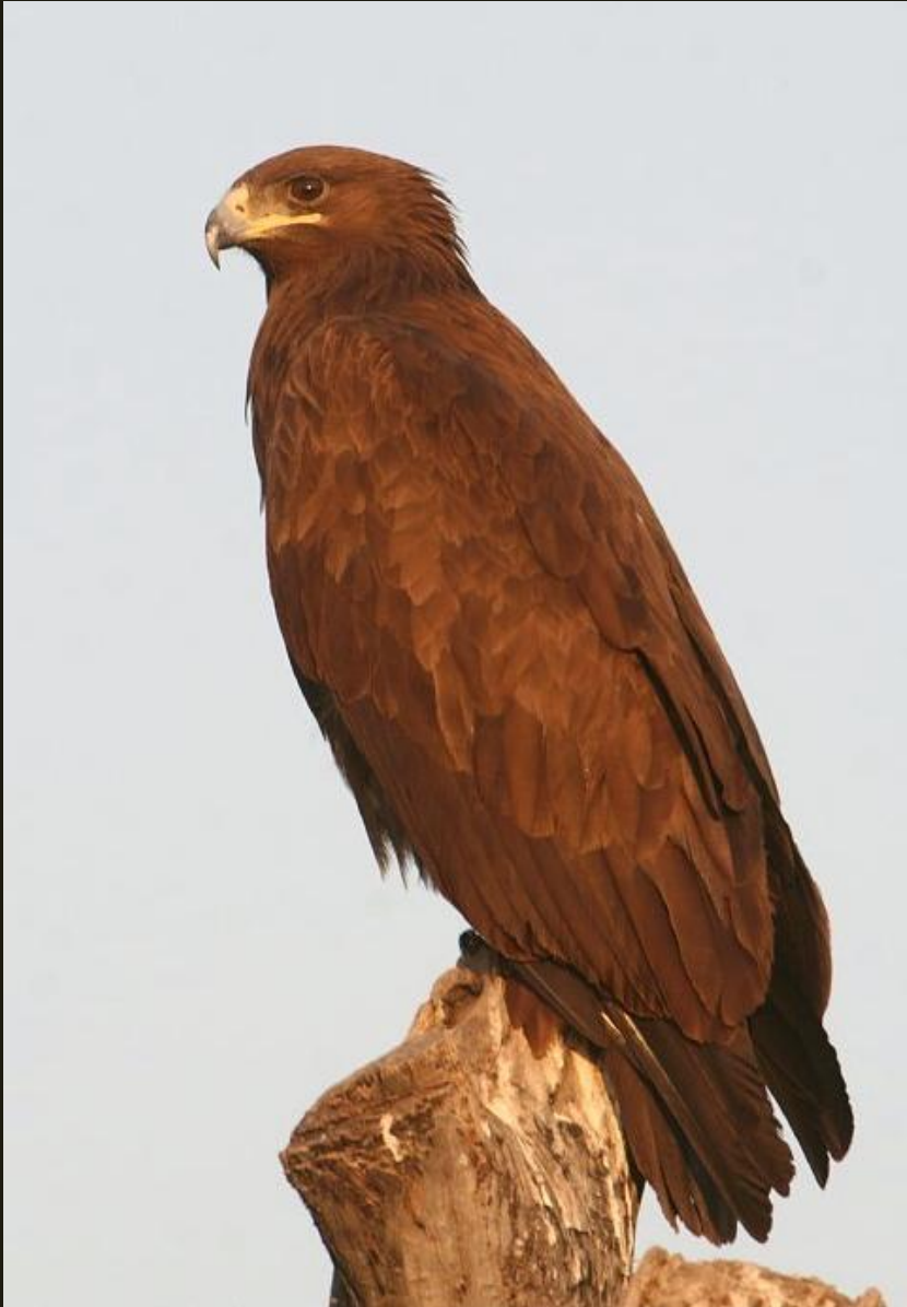
Greater Spotted Eagle (Adult)