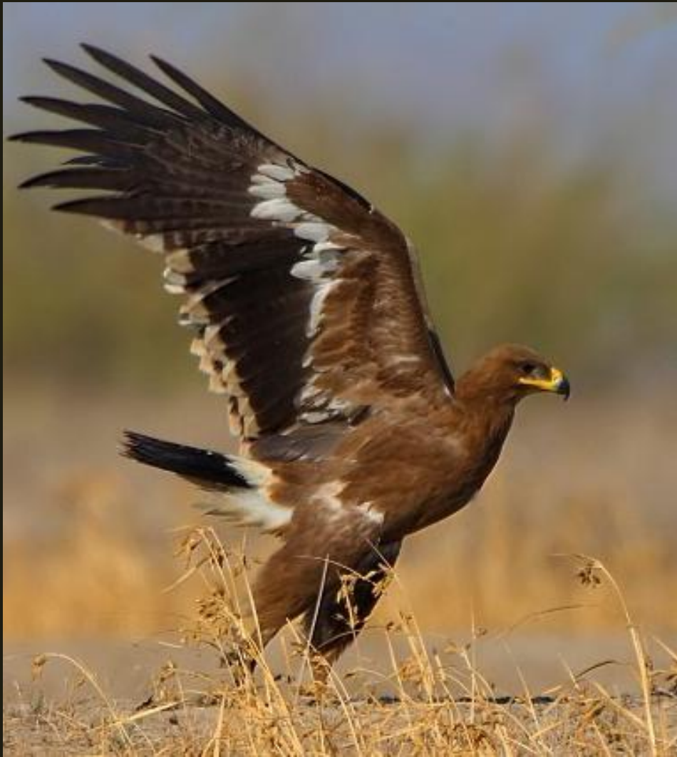
Steppe Eagle (Flight)