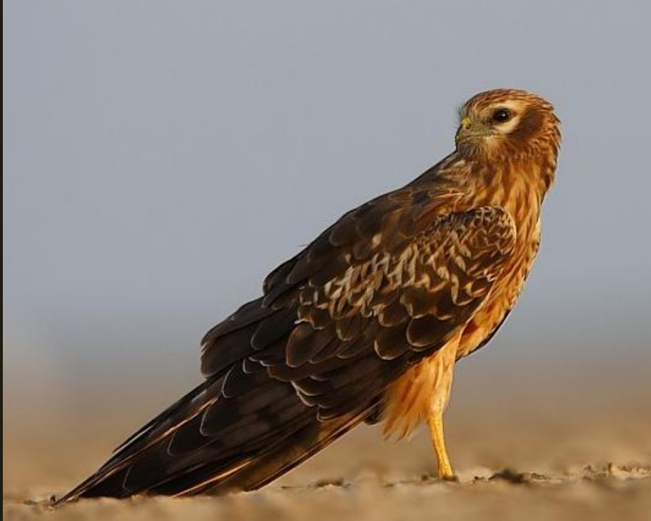
Montagu's Harrier (Female)