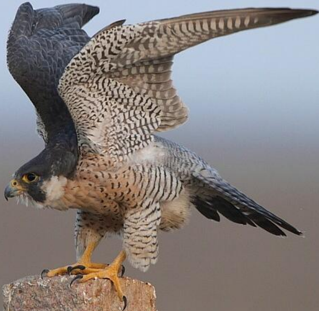
Peregrine Falcon (Adult)