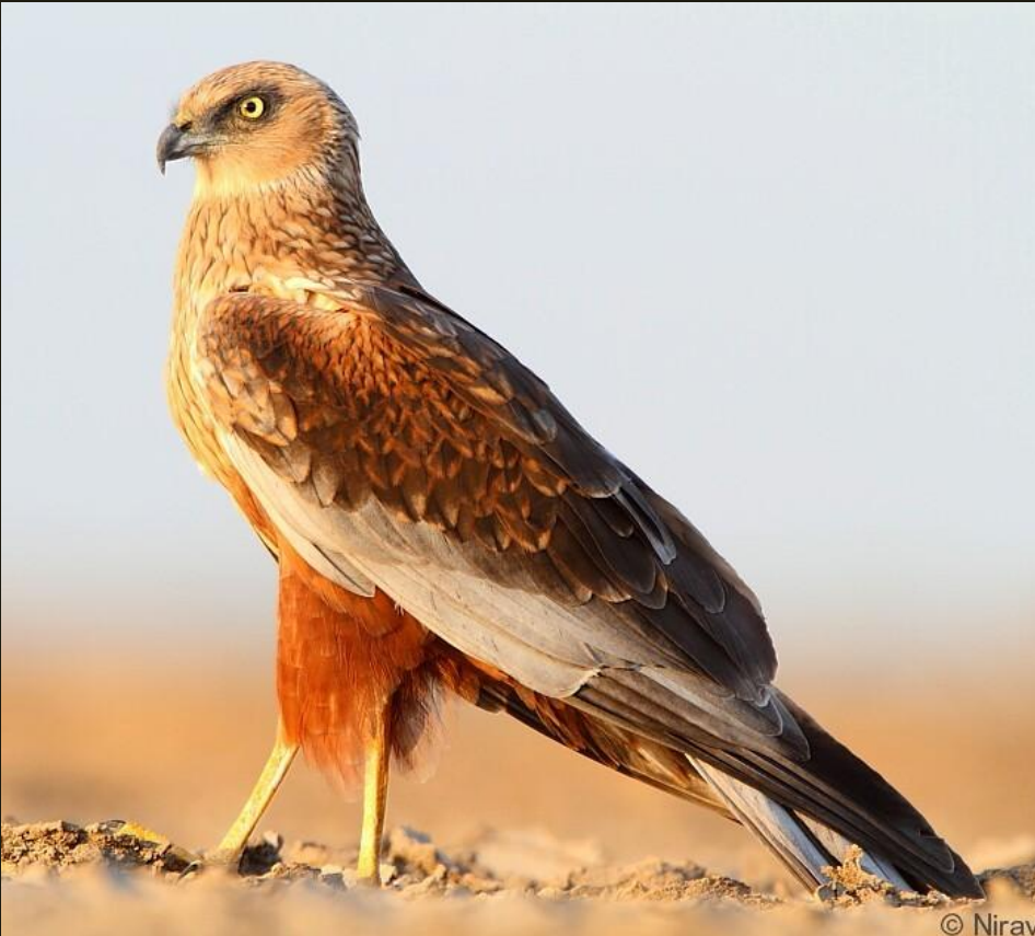
Eurasian Marsh Harrier (Female)