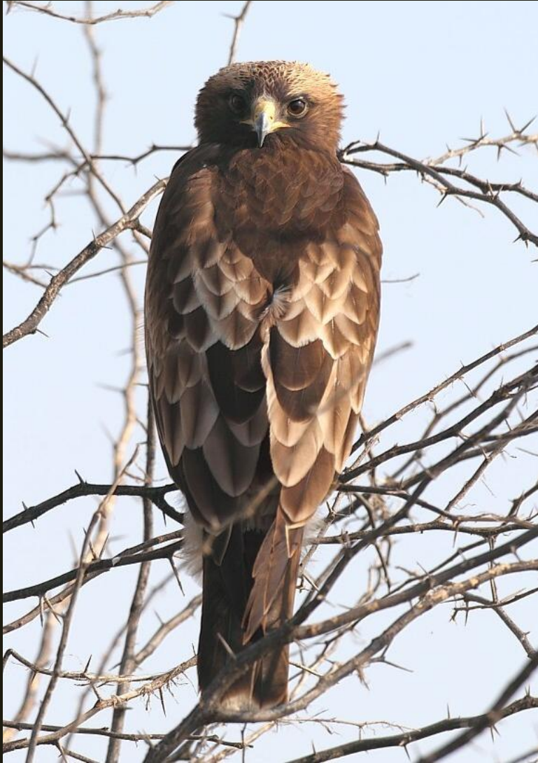
Booted Eagle 1