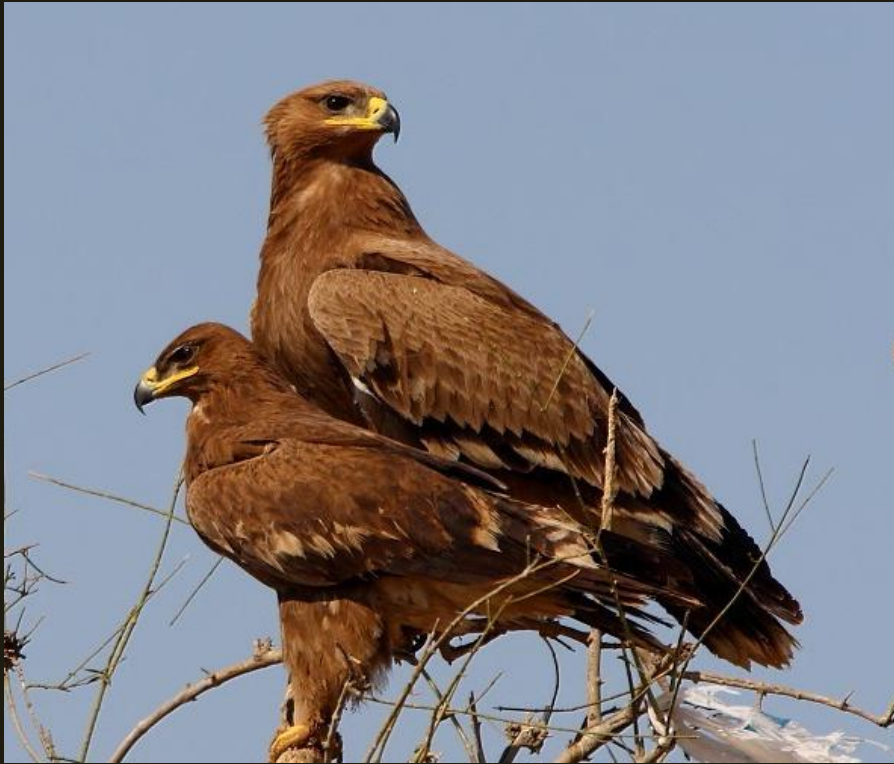
Both Steppe Eagle (Size Diff)