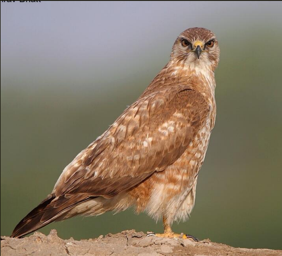
Long Legged Buzzard 2