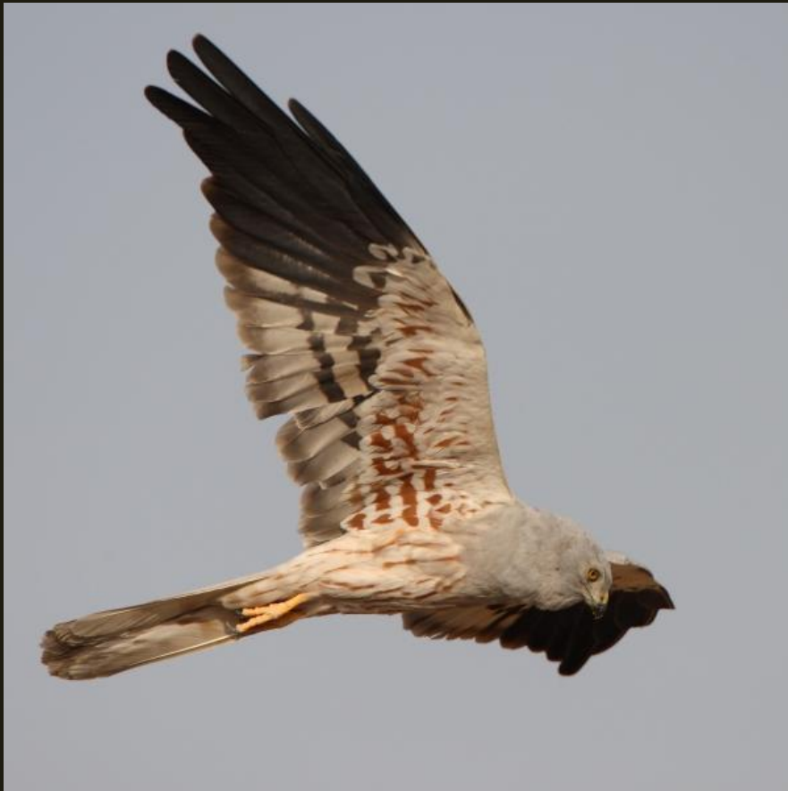
Montagu's Harrier (Male) 2