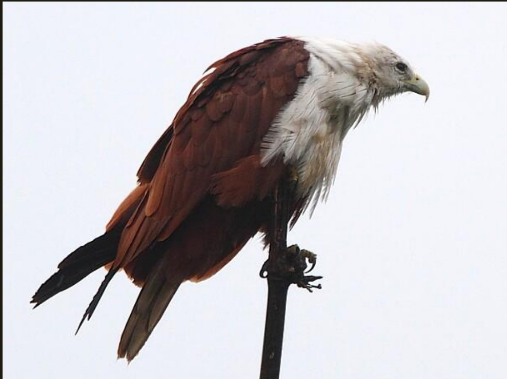
Brahminy Kite (Adult)