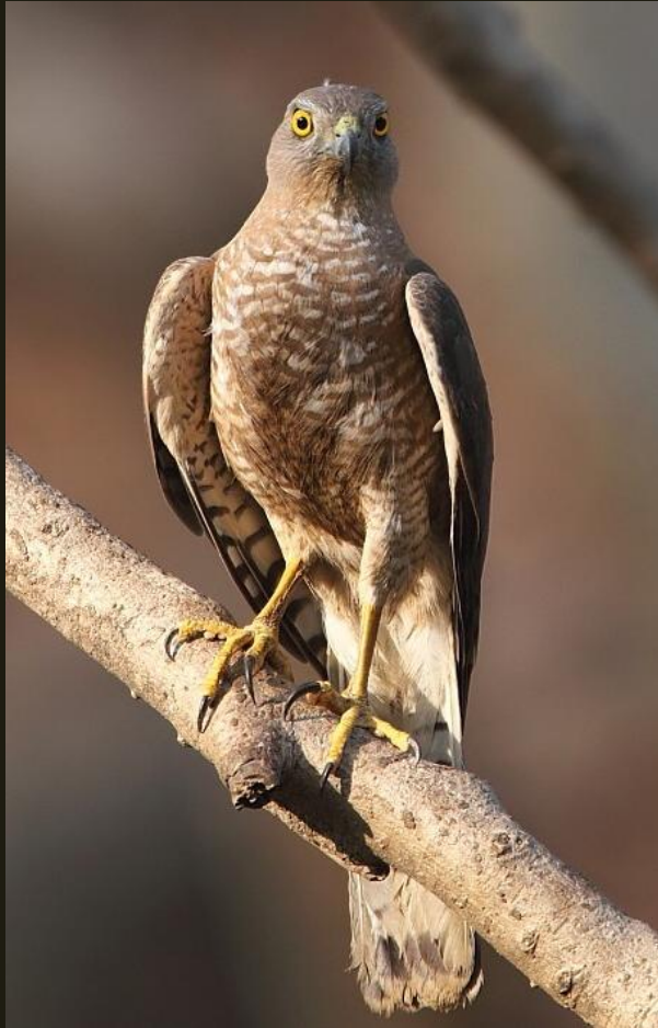
Shikra (Sub-Adult Female)