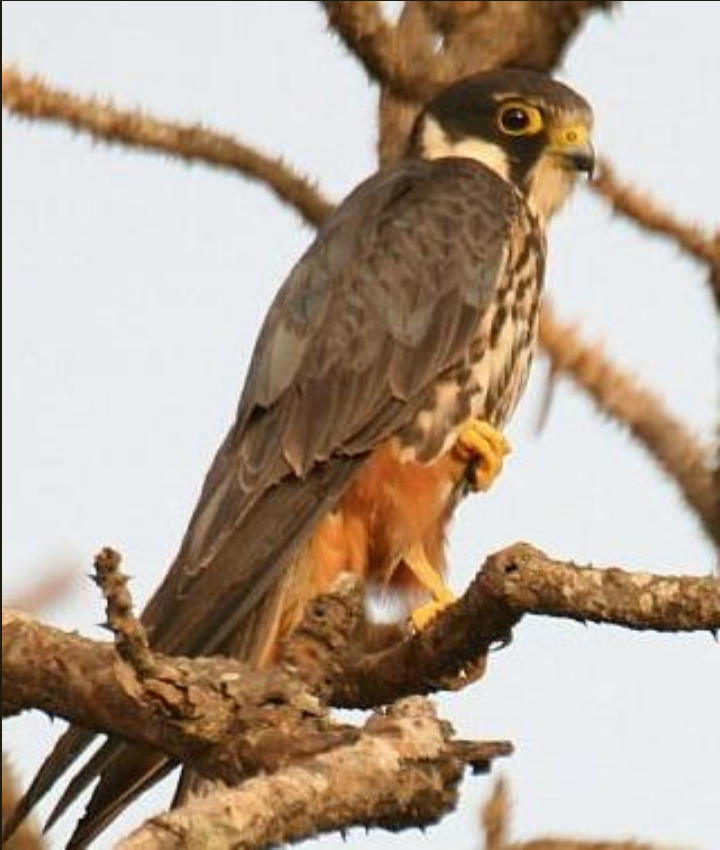
Eurasian Hobby (Adult)