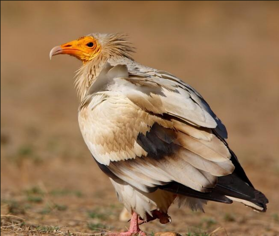
Southern Race (Resident)