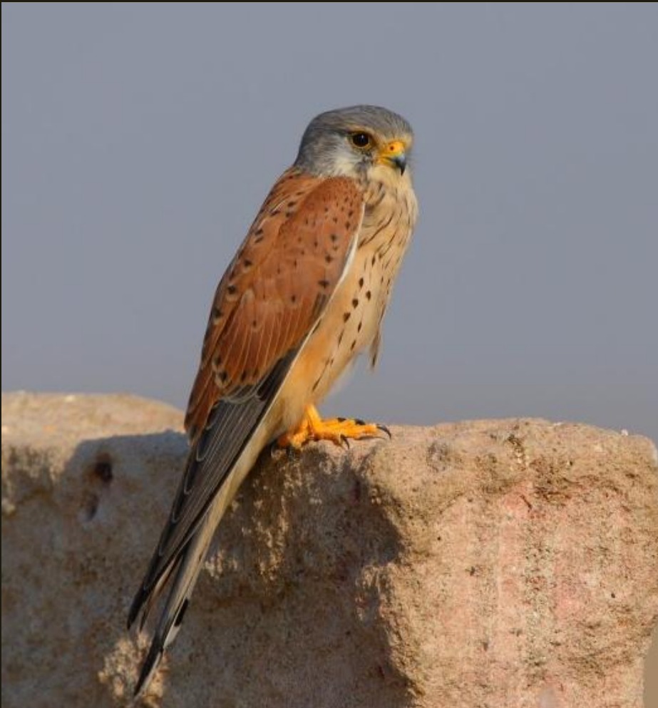
Common Kestrel (Adult Male)