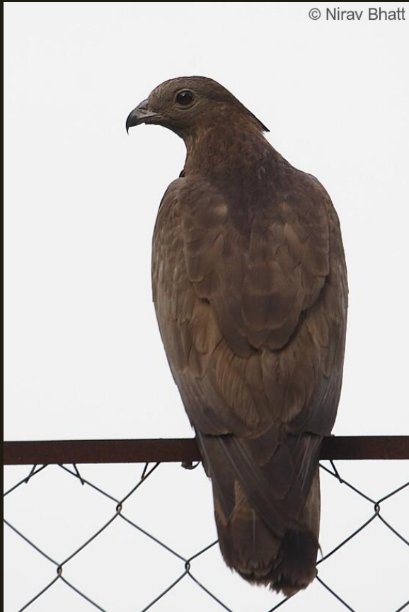
Oriental Honey Buzzard (Adult Male)