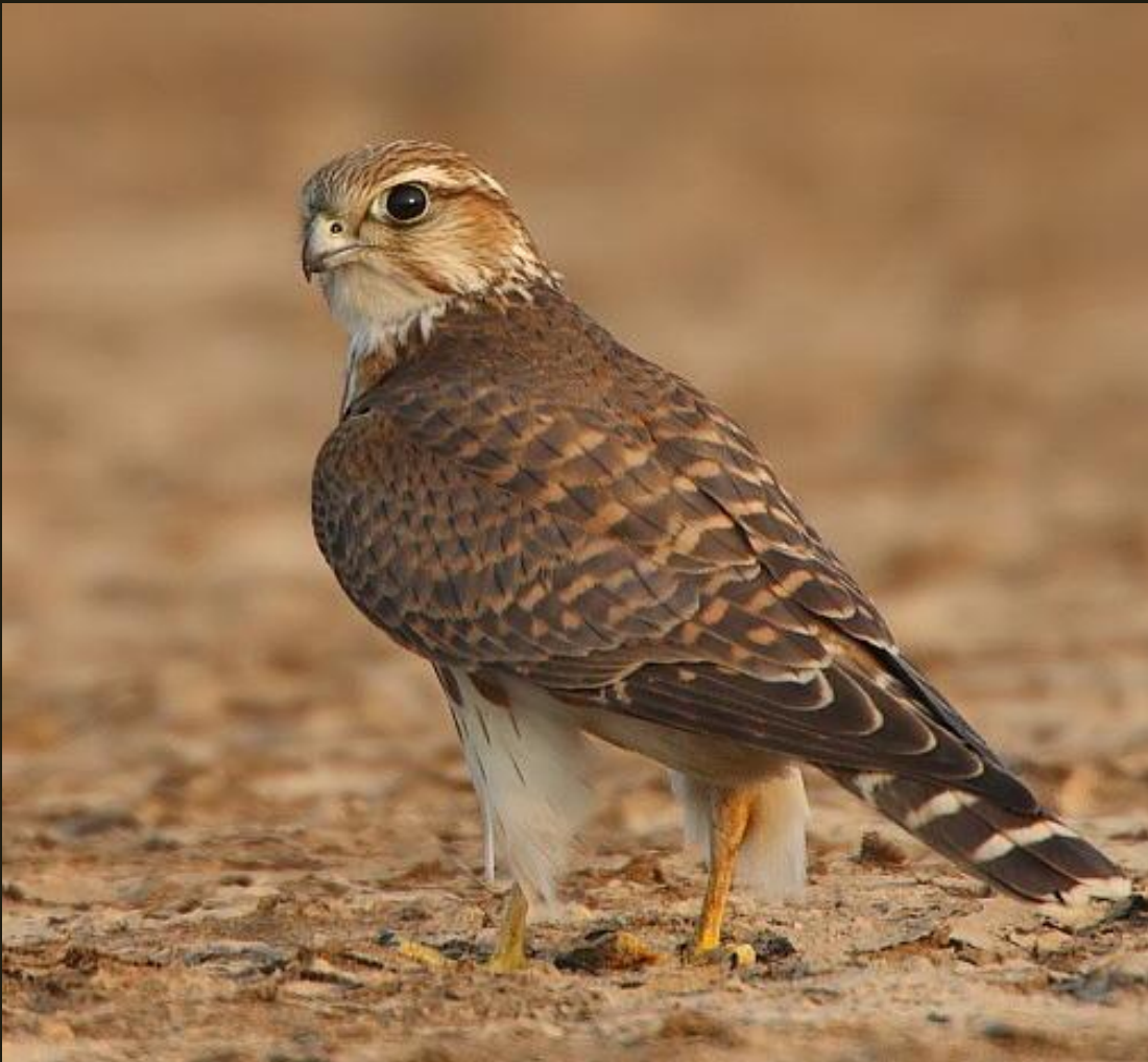
Merlin Juvenile 1