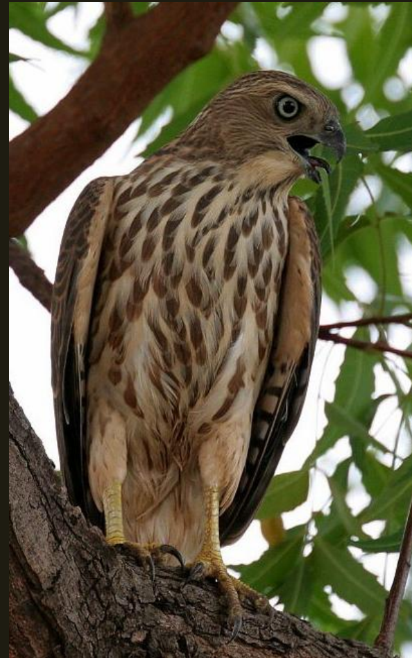
Shikra (Juvenile 2)