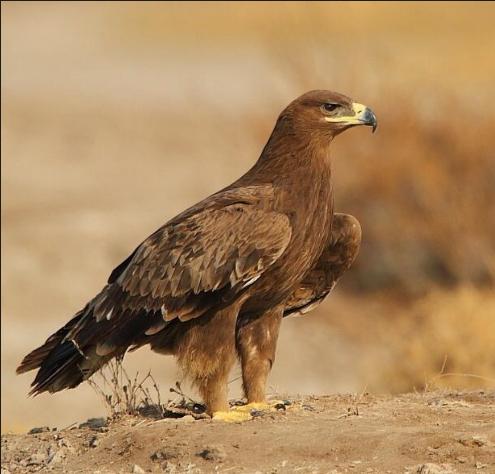
Steppe Eagle 1