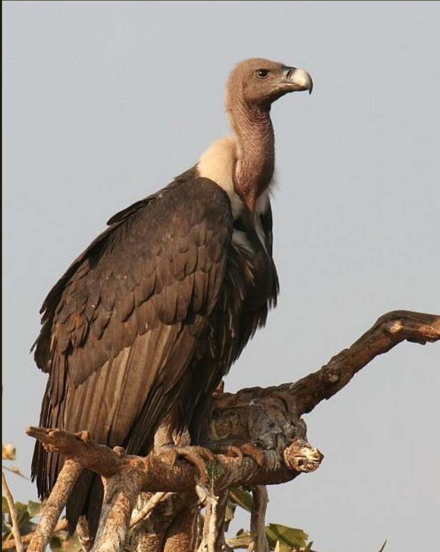
White Backed Vulture (Adult)