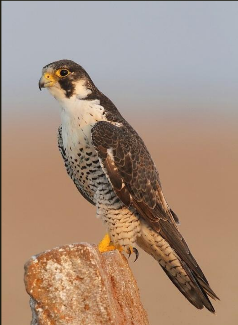
Peregrine Falcon (Adult)