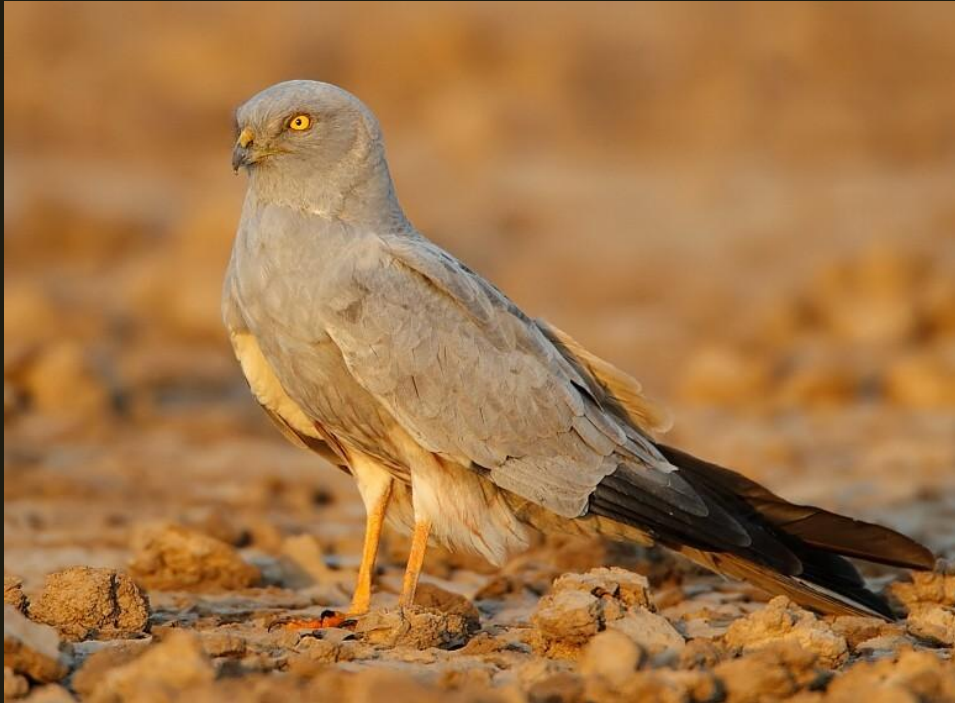
Montagu's Harrier (Male) 1