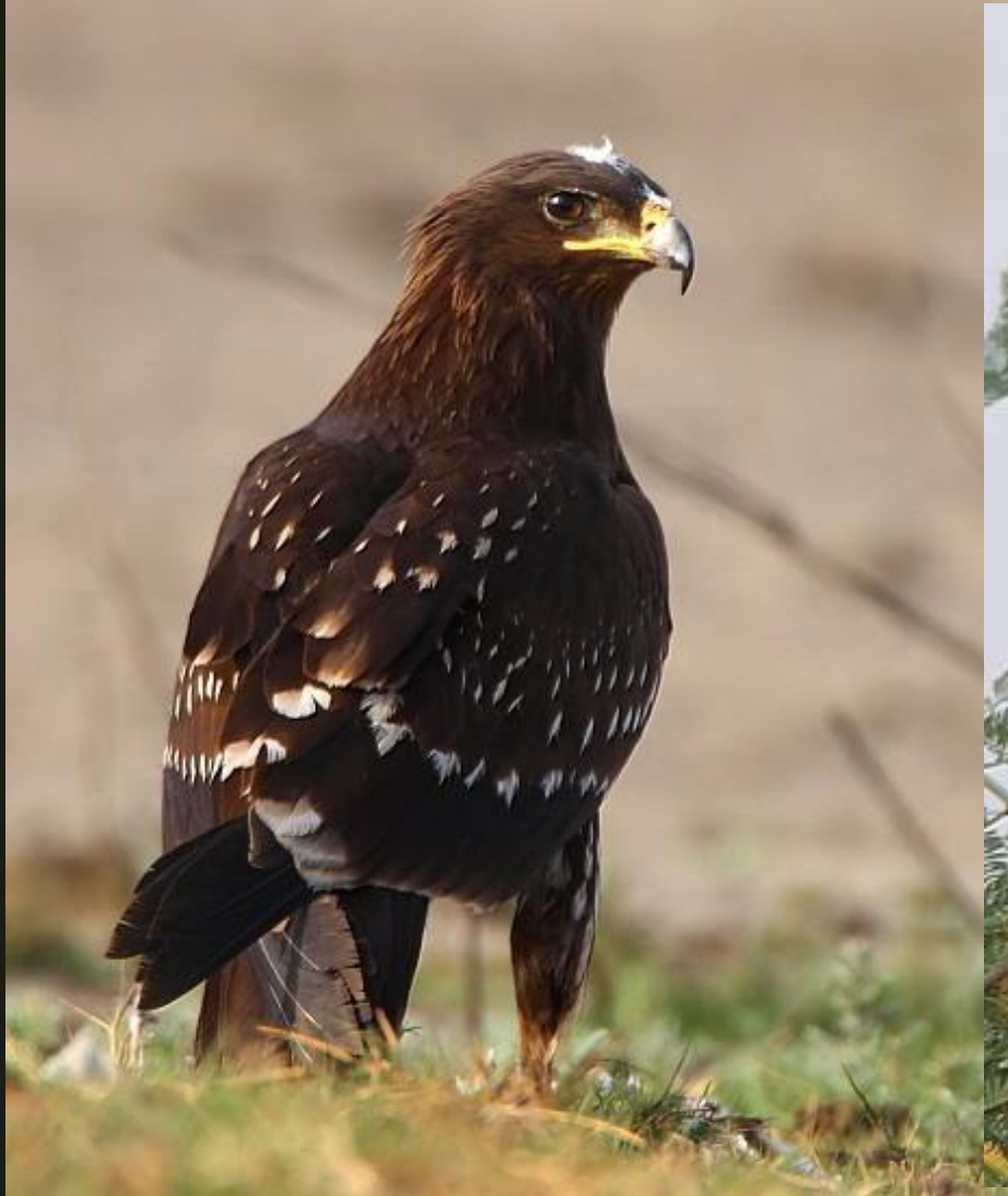
Greater Spotted Eagle