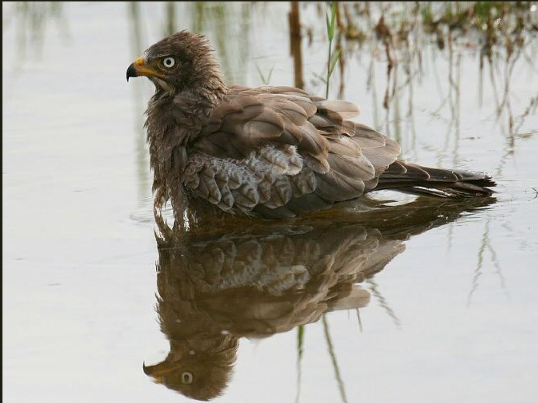
White Eyed Buzzard (Adult)