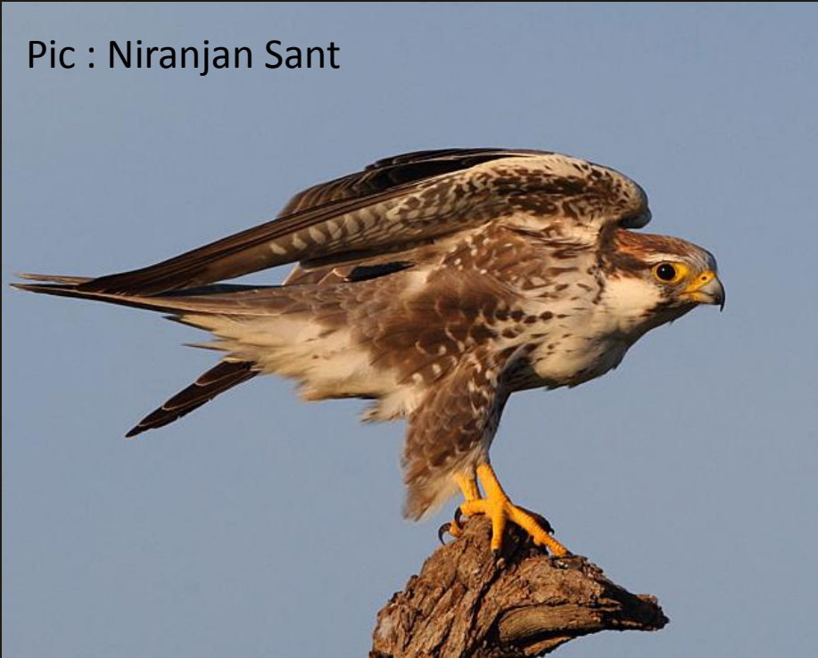
Laggar Falcon (Adult)