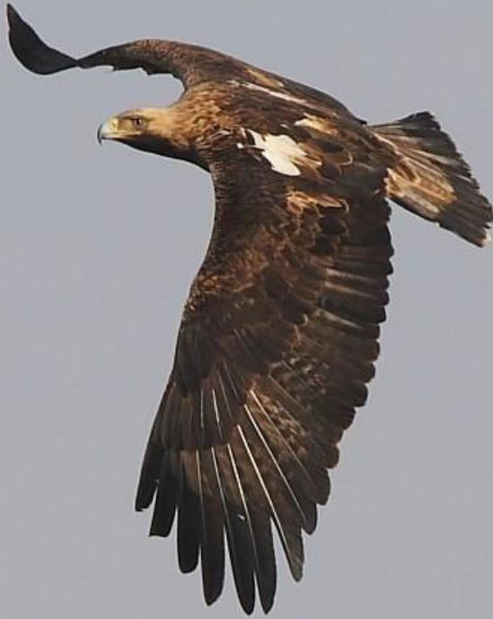
Eastern Imperial Eagle (Adult)